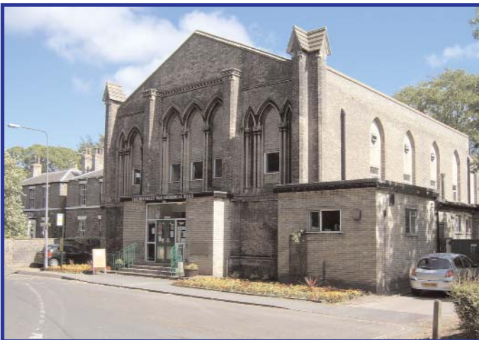
The picture shows the existing entrance to the Beverley War Memorial Hall which will become the ‘stage door’ entrance leading to a newly positioned stage. The main entrance to the building will be through Champney Road Gardens.

He went on to say: “We are particularly excited by the fact that the new main entrance will be from Champney Gardens, which will give us access for parking in the library car park in the evenings. This will make a tremendous difference to access to the hall and Champney Gardens for patrons.”