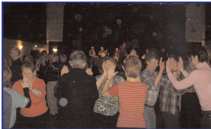
Public dances and private functions.