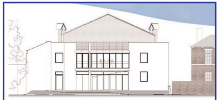
Artist’s impression of the front of the refurbished Beverley War Memorial Hall from Champney Road Gardens.